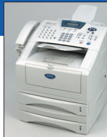
Shown with optional 2nd paper tray.

Adding images to your work has never been quicker or easier. Now, you can scan photos, images, and documents at resolutions up to 9600 dpi. ScanSoft® PaperPort® and OmniPage® OCR software are included for Windows® and Presto!®PageManager® for Mac®. Scanning features include "Scan to File," "Scan to E-mail," or "Scan to OCR."